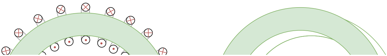
Fig. 18: Self-Induction of a toroidal Coil

The toroidal coil was analysed in the last chapter(see magnetic Field Strength Part 1: Toroidal Coil ). Here, a rectangular intersection a assumed (see figure 18 ).