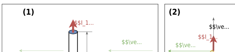
Fig. 2: Force onto a single Conductor in a B-Field