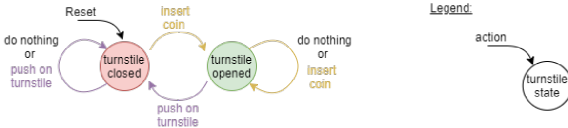
Fig. 12: State Transition Diagramm of the Entrance Control for Toilets

Out of this state transition diagram one can create a table-like representation, see figure 13.