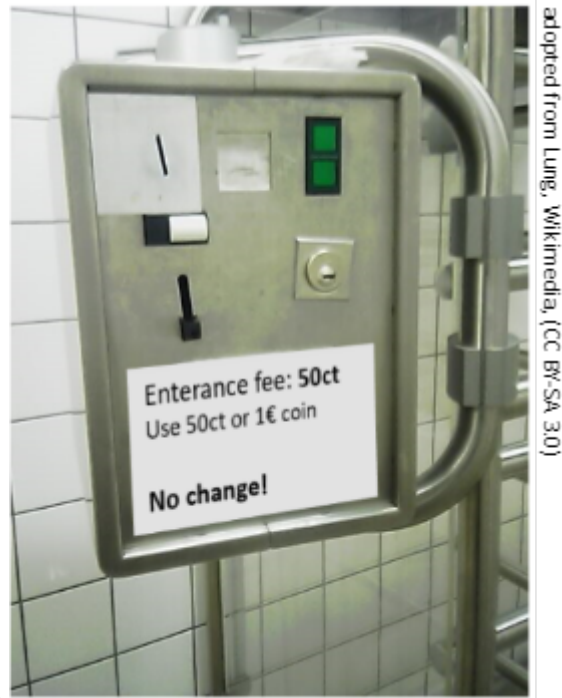
Fig. 11: Entrance Control for Toilets

The figure 12 the state transition diagram is drawn.