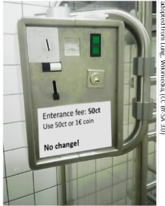
Fig. 11: Entrance Control for Toilets

The figure 12 the state transition diagram is drawn.