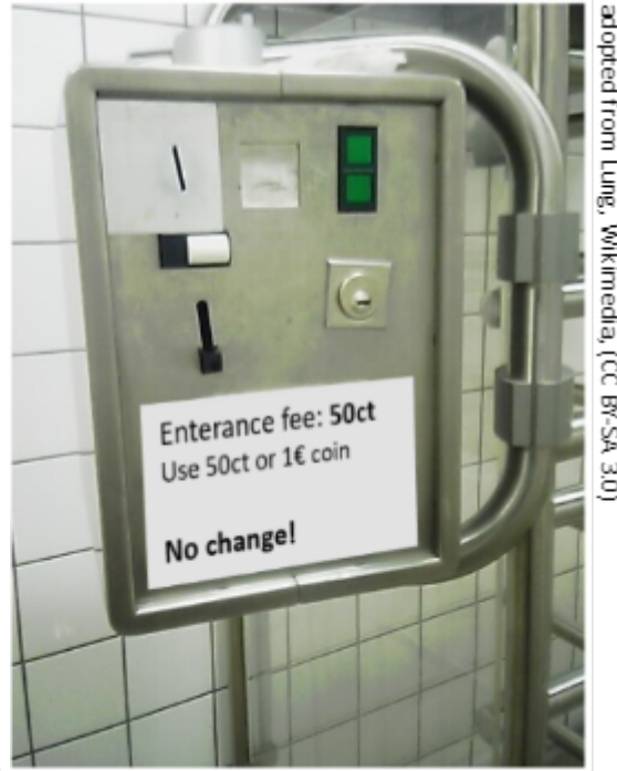
Fig. 11: Entrance Control for Toilets

The figure 12 the state transition diagram is drawn.