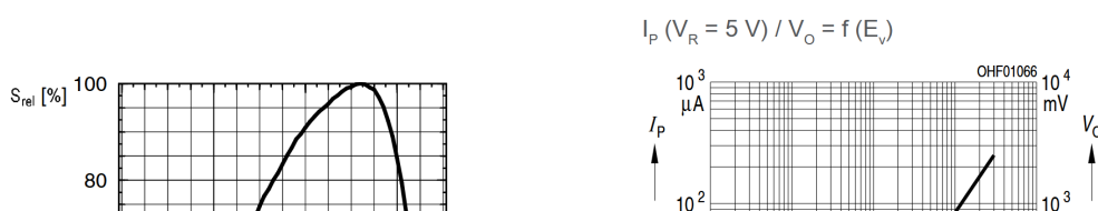
Fig. 3: Inverting Op-Amp: Diagramms of BPW 34 S