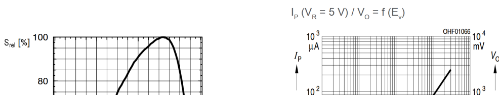
Fig. 3: Inverting Op-Amp: Diagramms of BPW 34 S